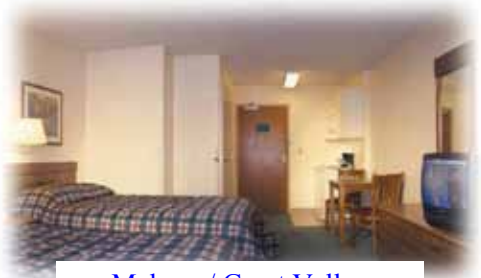
Malvern/ Great Valley

We are everywhere you need to be in the market!