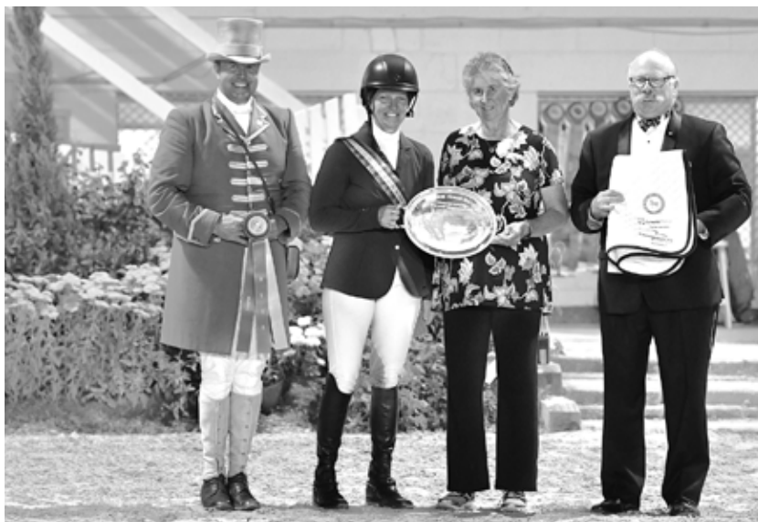
Beezie Madden, 2018 Leading Lady Rider