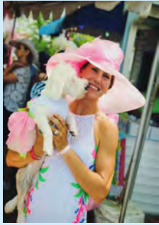
Around Main Line

Free general admission until 1 p.m. for ladies wearing elegant hats. Check Devon's website and Facebook page for this year's theme..