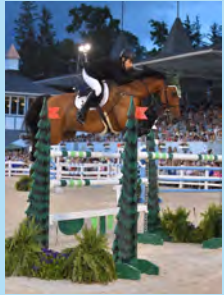
The Book LLC

Be sure to take it all in before the crowds of tonight's event. Our vendors offer many unique items including jewelry, home goods, equestrian items, and apparel.