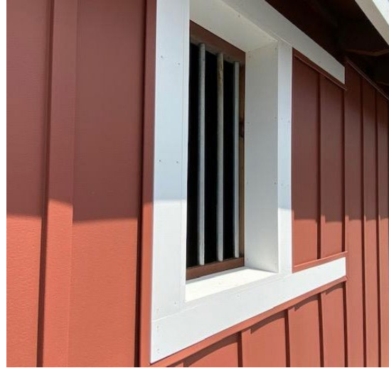
New walls and windows