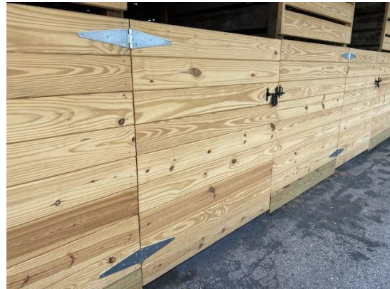
New barn stalls

Events at the historic Devon Horse Show grounds are just around the corner, with the Brandywine Horse Shows beginning June 30, 2021. In September, the Devon Fall Classic will take center stage September 15-19, followed by Dressage at Devon. Sponsorship for the Fall Classic is well underway and the 2022 sponsorship solicitation will begin in the summer of 2021. To find out more about sponsorship opportunities, contact sponsorship@devonhorseshow.org .