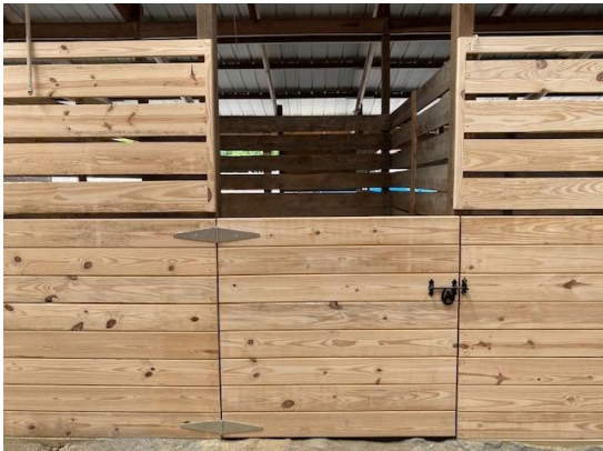
New barn stalls