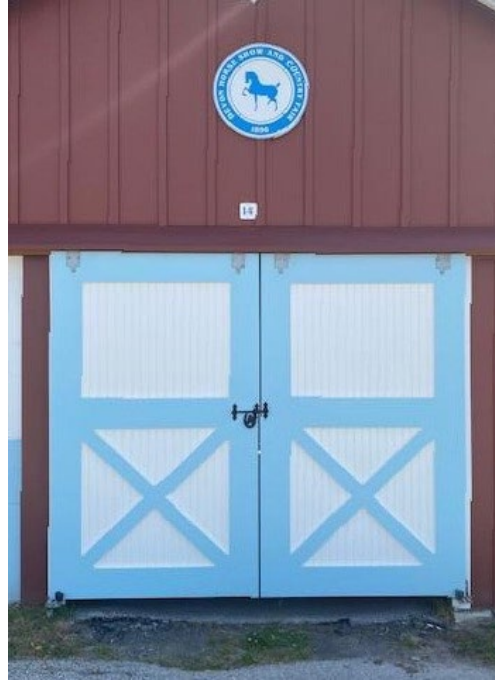
Stable doors after