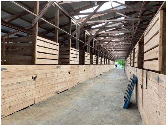
New barn stalls