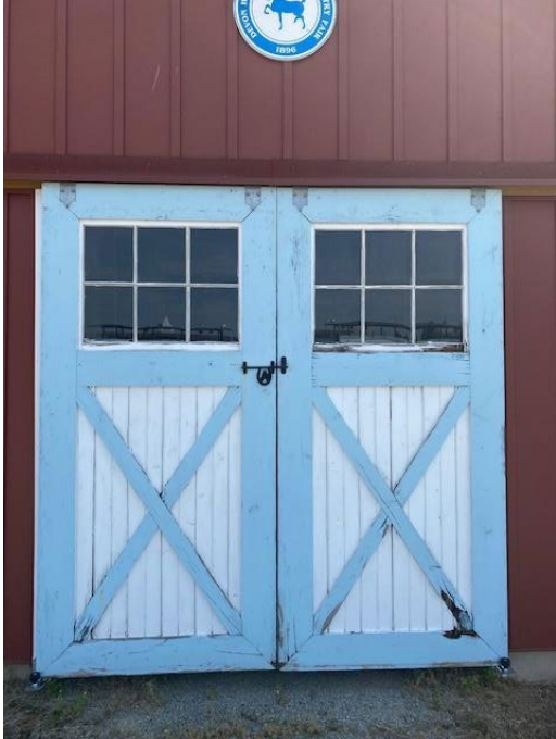
Stable doors before