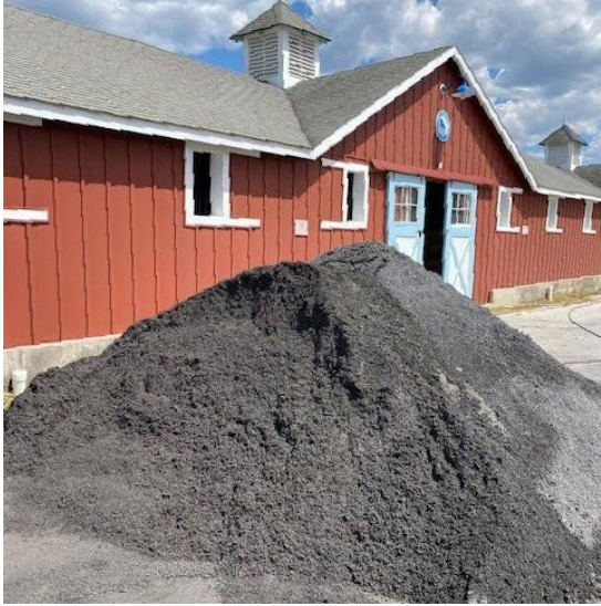
Fresh screening for stalls