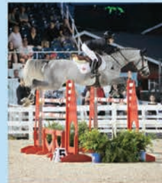
Sapphire Grand Prix