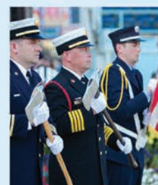
Tribute to Heros