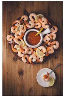
Firecracker Shrimp Cocktail (serves 4-6)