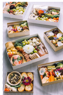
Charcuterie Grazing Box (serves 4-6)