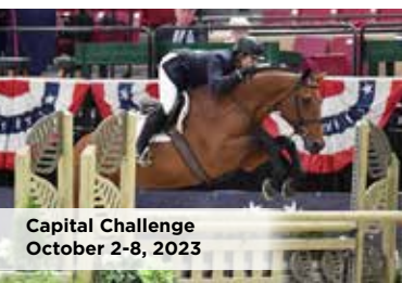
Capital Challenge October 2-8, 2023