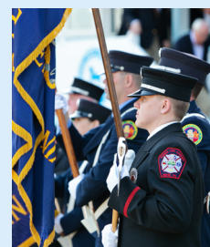
Tribute to Heroes