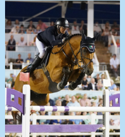
Sapphire Grand Prix