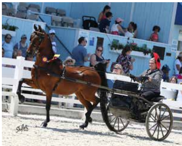
Heirial Heir & Carolyn Virtue

To be eligible, horses must have been entered, shown and judged in class 398.