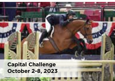
Capital Challenge October 2-8, 2023