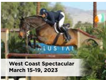
West Coast Spectacular March 15-19, 2023