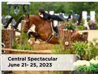
Central Spectacular June 21- 25, 2023