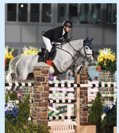
Idle Dice Open Jumper