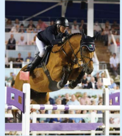
Sapphire Grand Prix