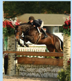
Devon Speed Derby