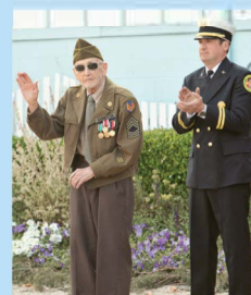
Tribute to Heroes