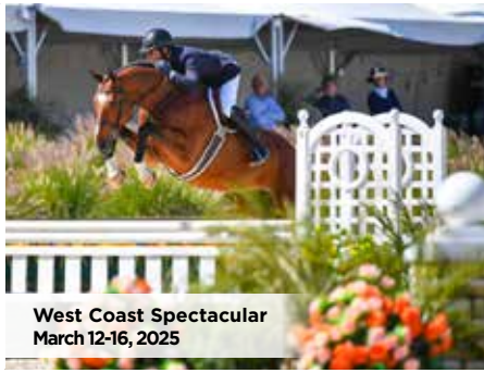
West Coast Spectacular March 12-16, 2025