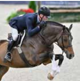
Capital Challenge September 29- October 5, 2025