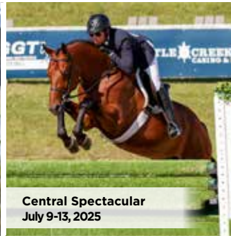
Central Spectacular July 9-13, 2025

United States Hunter Jumper Association has chosen Devon to host the 2025 International Hunter Derby Class NORTH - Zones 1 & 2