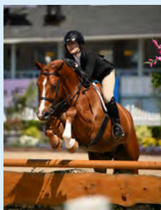
KIND Media LLC

DAYTIME (8:00 a.m. – 2:30 p.m.) WELCOME BACK!