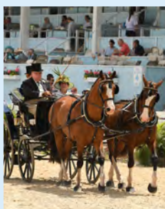
Kind Media LLC