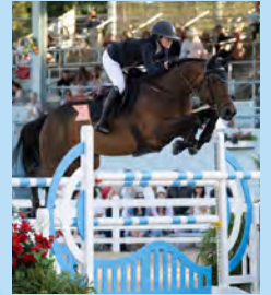
Devon Speed Derby