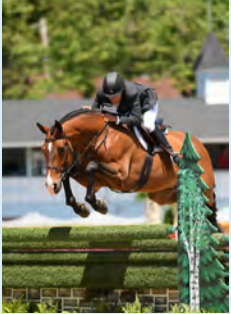
Kind Media LLC