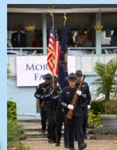
Tribute to Heroes