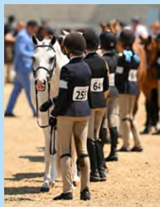
KIND Media LLC/Brenda Carpenter

DAYTIME (8:00 a.m. – 7:15 p.m.) WELCOME BACK! Country Fair stays open until 9:00 p.m.