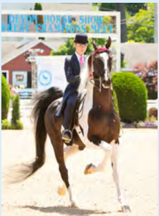
Kind Media LLC