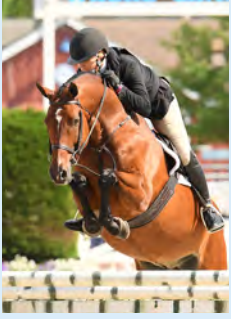
Kind Media LLC

DAYTIME (8:00 a.m. – 5:30 p.m.) FAMILY DAY