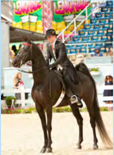
Kind Media LLC