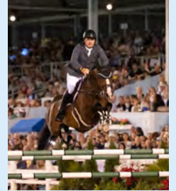
Sapphire Grand Prix