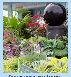
See you next year for the 2025 Devon Horse Show and Country Fair! May 20- May 31, 2026

Be sure to pick up your own Devon window box featuring the iconic salmon geraniums and an assortment of perennials and annuals. The plant sale will begin following the last class and will include many of the plants and flowers featured in the ring and around the grounds.