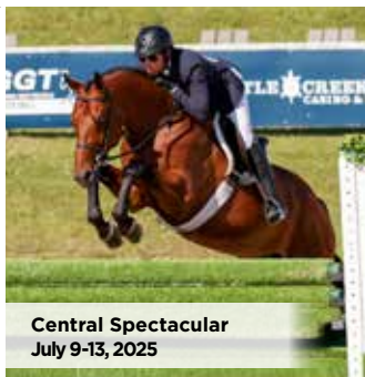
Central Spectacular July 9-13, 2025

United States Hunter Jumper Association has chosen Devon to host the 2025 International Hunter Derby Class NORTH - Zones 1 & 2