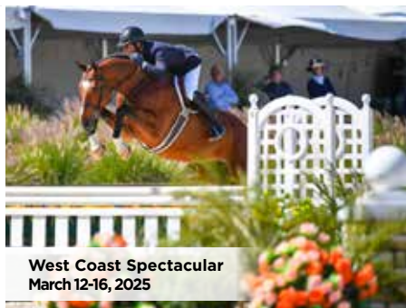
West Coast Spectacular March 12-16, 2025