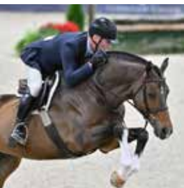
Capital Challenge September 29- October 5, 2025