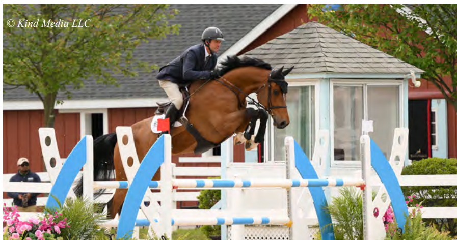
Karl Beyer & Lillet Wildberry, 2025 7 Year Old Jumper East Coast

Prize Money for classes 260-269 will be distributed as shown in the table on Page 53 unless stated otherwise: